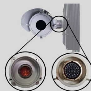
Rapid Release Mechanism